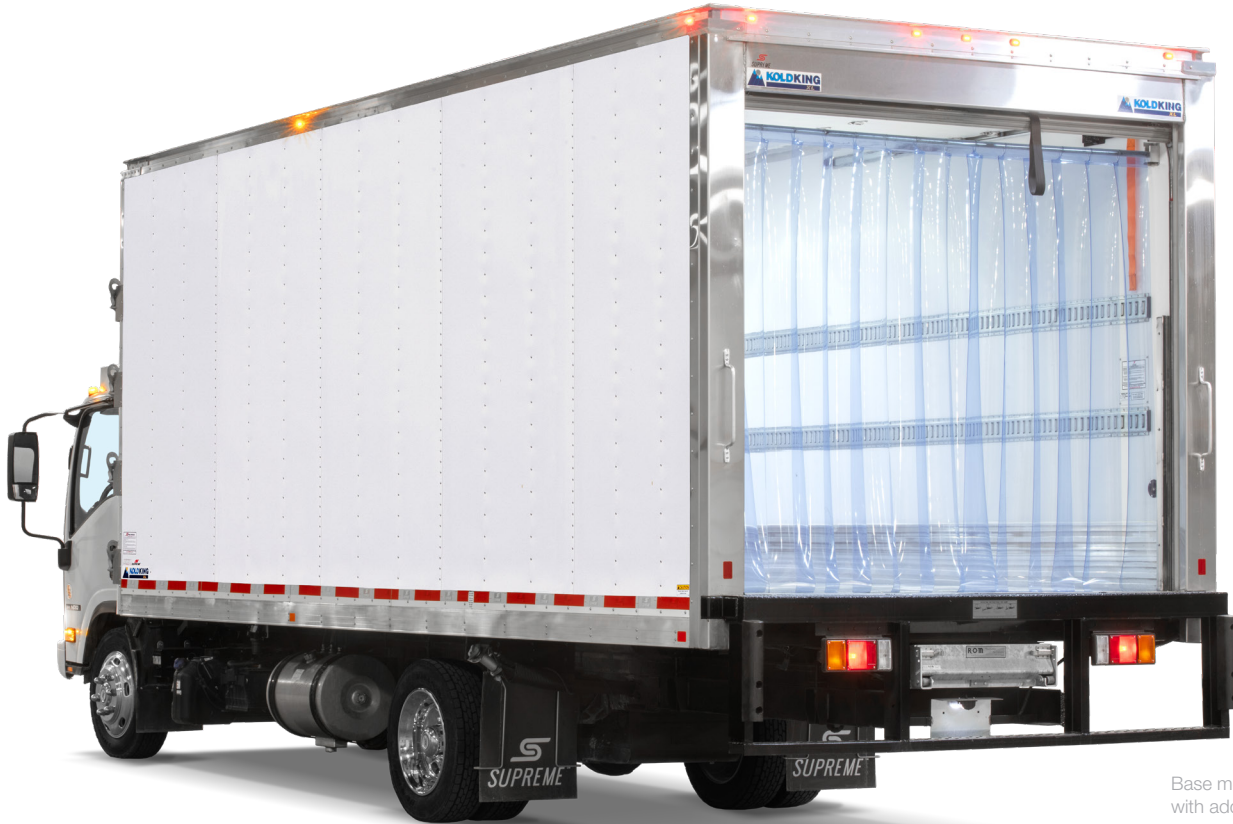
Base model shown with added options