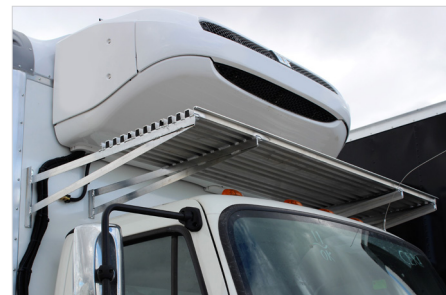
Reefer Service Platform

Call 800-642-4889 Online supremetruckbody.com