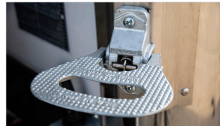
Folding Reefer Steps