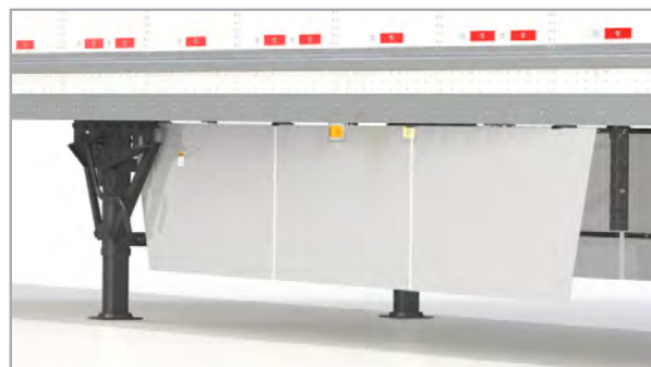
Impact and abrasion resistant – made with highly engineered composite panels for optimum flexibility, strength and durability