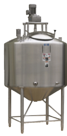
Stainless steel Processing Tanks