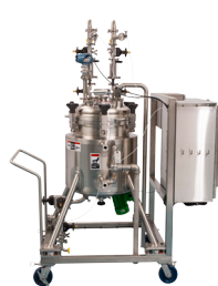
Pharmaceutical Reactor Vessels